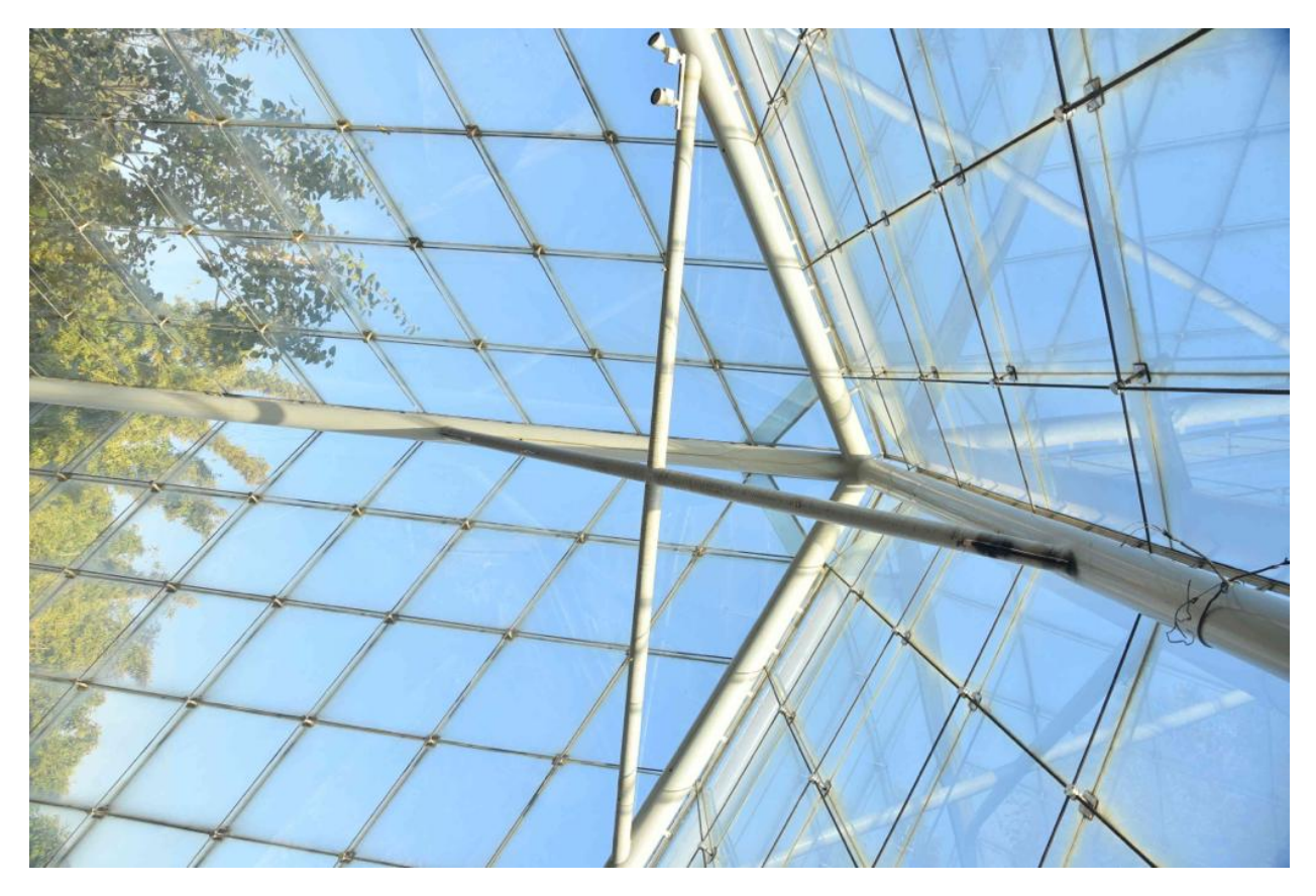
Plot No. 6 Photograph No. 10