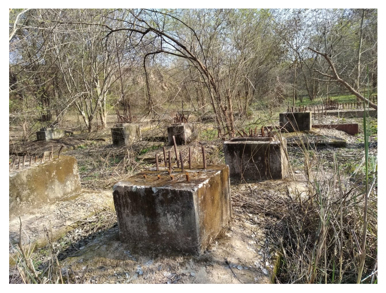
Adj. Plot No. 7 Photograph No.9 Club Area